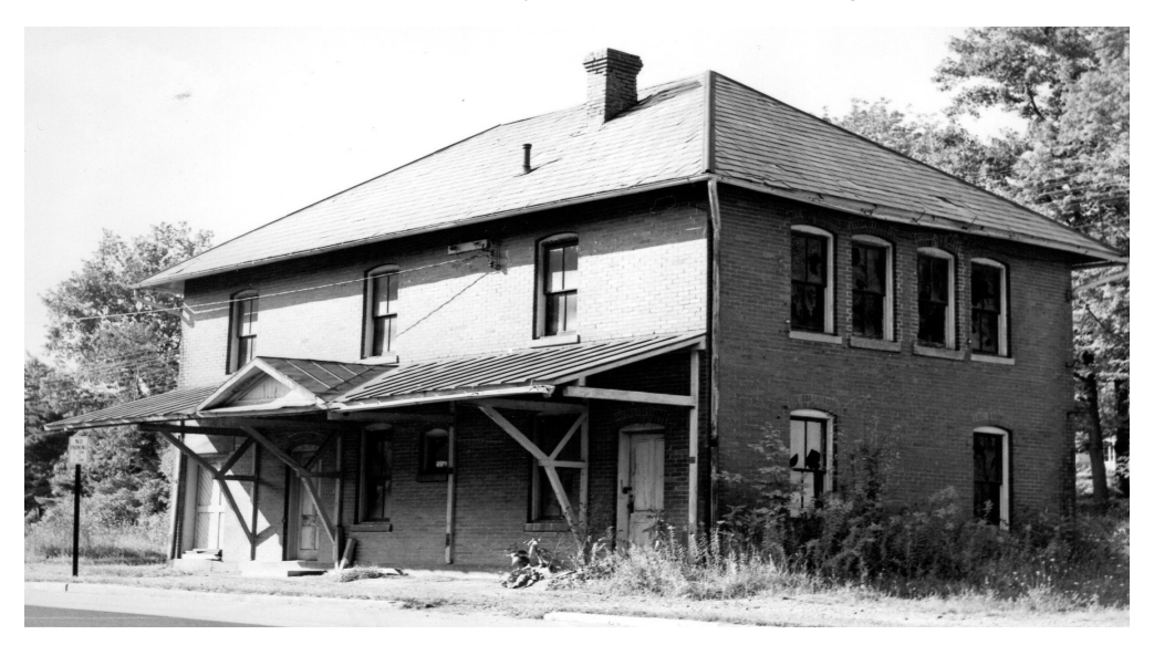
Tionesta Valley RR Depot—removed in 1968 Photo by Tom Curtin, 1967